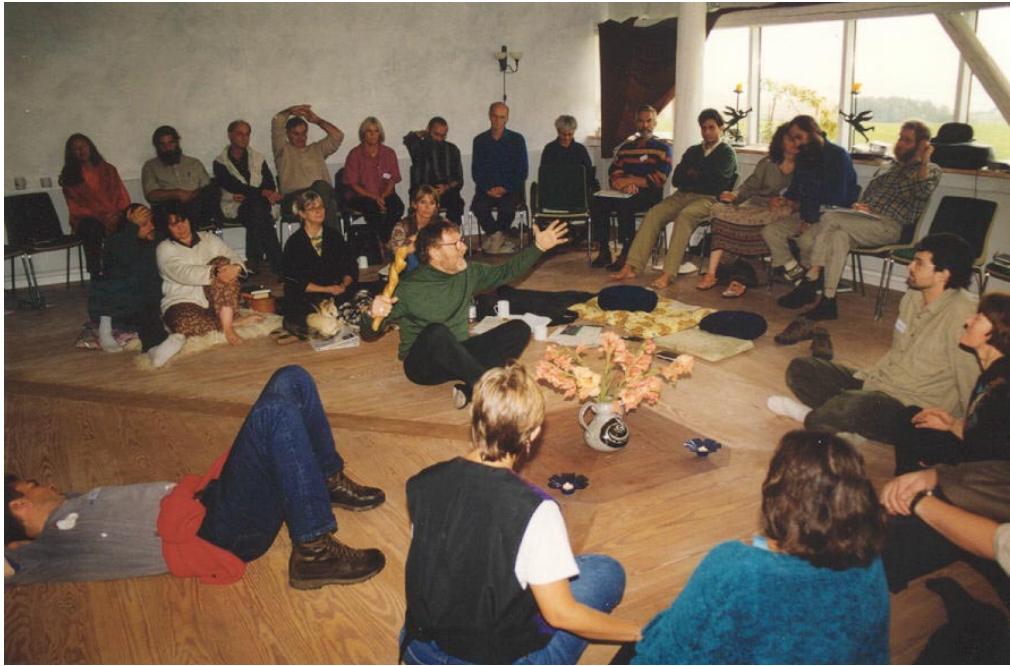
Ecovillage Education Meeting at Fjordvang, 1998