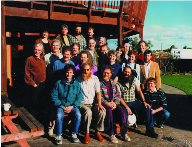
Founding group at Findhorn, 1995

Immediately following this meeting, 20 people from different ecovillages meet for 5 days in the Community Center of Findhorn, where it was decided to formally establish the Global Ecovillage Network, consisting of three autonomous regional networks to cover the globe geographically, with administrative centers at The Farm (USA), Lebensgarten, (Germany) and Crystal Waters (Australia), with an international coordinating office at Gaia Trust, Denmark. Gaia Trust committed to covering the expenses of the network for 3-5 years. The plan was to focus initially on forming regional networks that would link existing projects. At the same time a second goal was set to create global services, like an education network, that would cut across regions, as soon as budgets and manpower permitted. But that never happened. We are only now getting to this point in the spring of 2004 of creating a global educational network and a common educational curriculum.