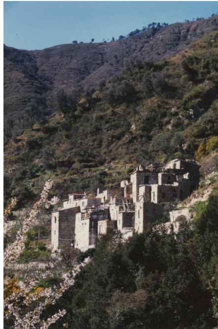
Torri Superiori in Italy