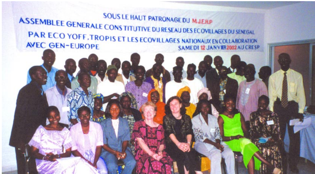
Founding Meeting of GENSEN, the Ecovillage Network of Senegal

adjustment” policies, which tend to destroy community and the environment. The network is slowly expanding into several countries of West Africa.