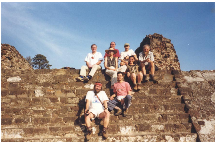
The GEN Board takes a break on a Mexican pyramid